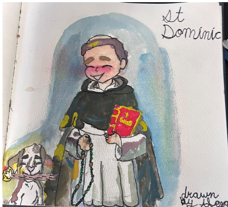
Drawing of St. Dominic by Alexa Cruz, 6th grade

Divine Mercy Ministry is taking up a collection for Works of Mercy. Personal hygiene items for men and women are needed for underserved communities. Travel size toiletries such as toothpaste, toothbrushes, deodorant, soap, sanitary pads, socks and new underwear, gloves, scarves as well as shoes for both men and women are sought. Please bring items to the Church if you are able to donate and drop off in narthex basket labeled "Divina Misericordia". The next day for distribution will be February 15th. People are also sought who would like to provide food or go hand out items please sign up at the Narthex. Teens, your help will count towards your Confirmation service hours.